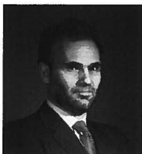
HEAD OF DEPARTMENT

LAW FIRM | DEPARTMENT | PRACTICE AREAS | CLIENTS